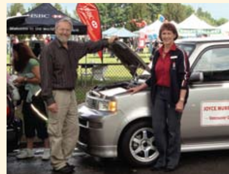
Our local MP Joyce Murray with her husband, showing the electric Scion she rode for the parade

After the parade, the focus shifts to Trimble Park where opening ceremonies are held on The Stage in the presence of our local VIPs. Many shows are performed there throughout