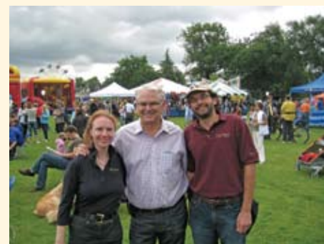
With our local MLA: BC premier Gordon Campbell

I enthusiastically participated in the parade and enjoyed waving at our many clients, friends, and neighbours.