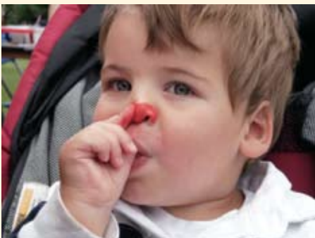
Our tired but happy nephew!