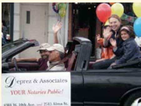
We proudly participated in the parade this year with our family. That's me in the passenger seat.