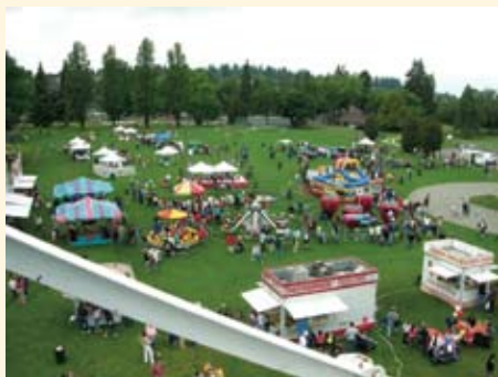
Carnival rides at Trimble Park as seen from the ferris wheel