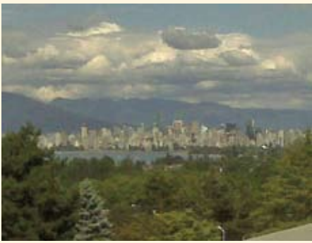
The Vancouver city skyline from the top of the ferris wheel